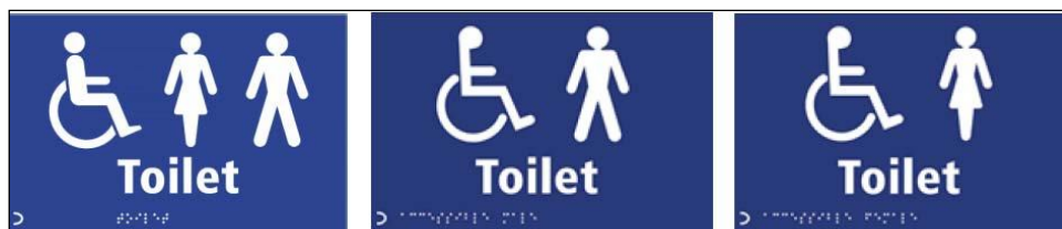
Fig. 13.5 - Signage for accessible washroom