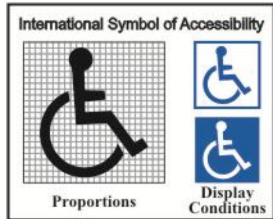
Fig. 13.2 - International Symbol of accessibility