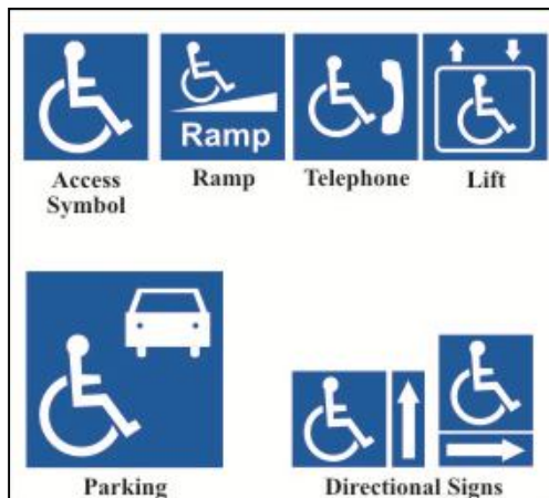
Fig. 13.1 - Way finding signage