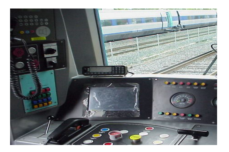
Fig.8.4 : View of the Driving Cab

The modern stylish driver panel shall be FRP moulded which give maximum comfort and easy accessibility of different monitoring equipments to the driver along with clear visibility. The driver seat has been provided at the left side of the cabin.