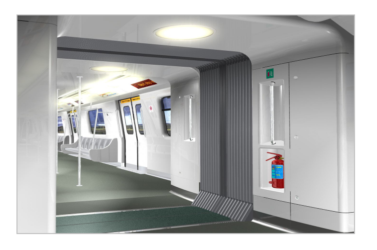
Fig.8.5 : View of the Gangway

The salient features of the proposed Rolling Stock are enclosed as Attachment-I