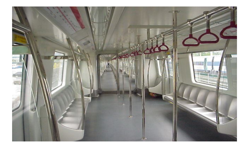
Fig.8.2 Interior View of the Car

Passenger capacity of a car is maximized in a Metro System by providing longitudinal seats for seating and utilizing the remaining space for standing passenger. Therefore all the equipments are mounted on the under frame for maximum space utilization. The gangways are designed to give a wider comfortable standing space during peak hours along with easy and faster passenger movement especially in case of emergency.