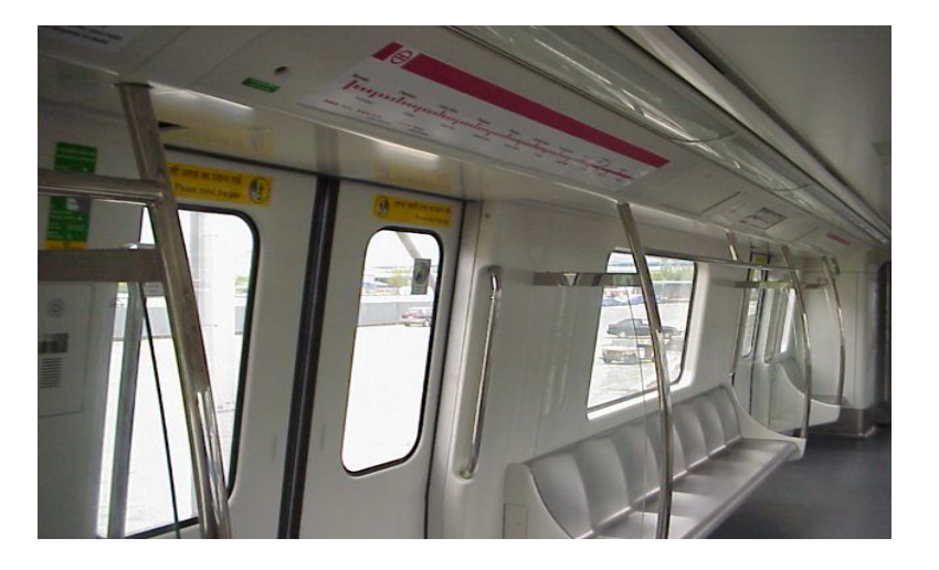
Fig.8.3 : View of the Passenger Doors

The door shall be of Bi-parting Sliding Type as in the existing coaches of DMRC.