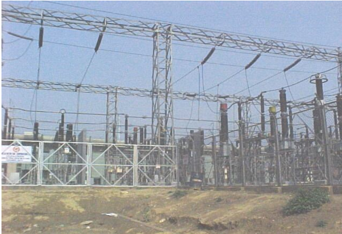
Fig. 9.1 : Typical High Voltage Receiving Sub-station

services can be catered to by stand-by DG sets. Therefore, while the proposed scheme is expected to ensure adequate reliability, it would cater to emergency situations as well.