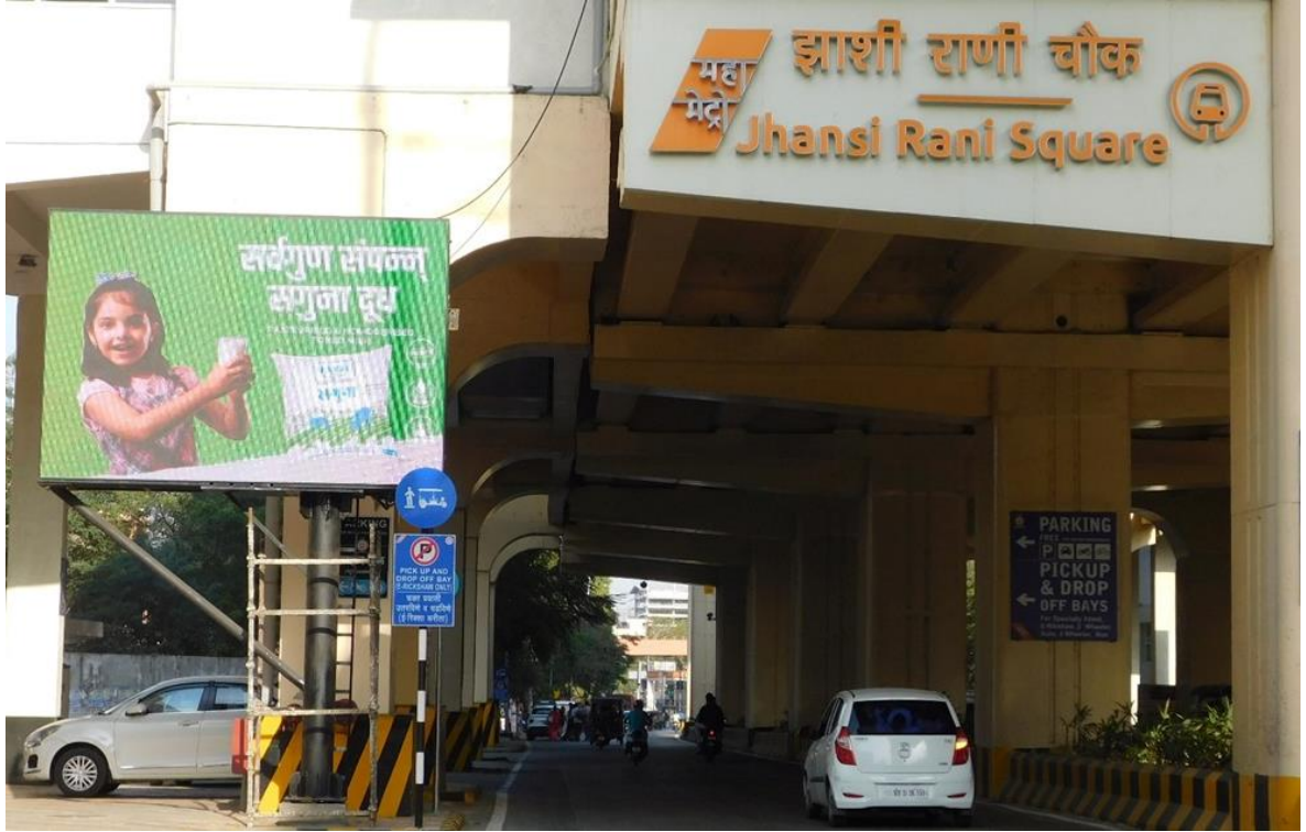
Jhansi Rani Square Metro Station