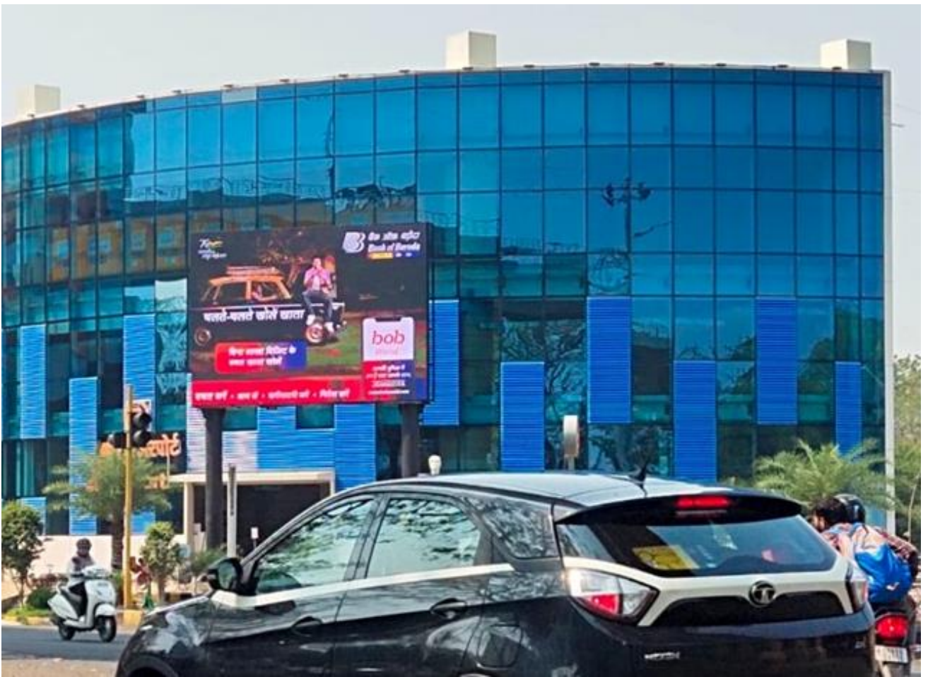
Airport Metro Station