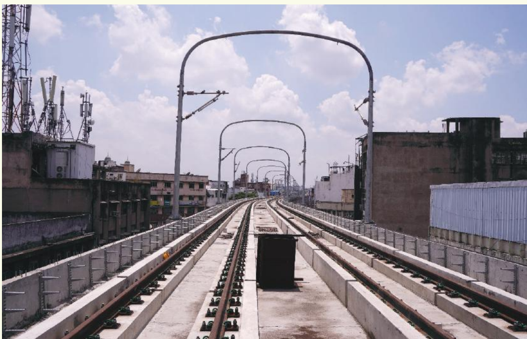
TRACK LAYING AT NAGPUR