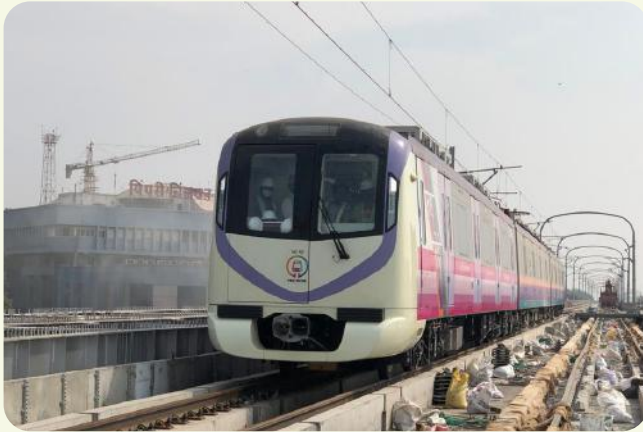
Trial Run Pimpri-Chinchwad