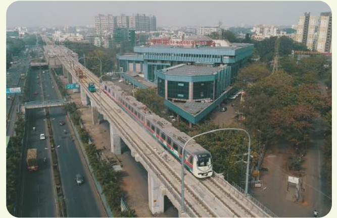
Arial View: Trial Run Pimpri-Chinchwad

The New Year started with a bang for Pune Metro project. On January 3rd of 2021, the project successfully carried out the trial run of train operations along the 6 km priority section from PCMC station to Phugewadi station of North-South Corridor.