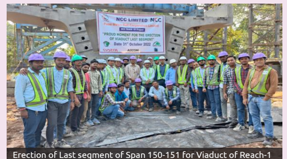
Erection of Last segment of Span 150-151 for Viaduct of Reach-1

It needs to be taken into account that work for systems contract and Stations on remaining section of Reach 1 is already going on in full swing and the section after Phugewadi till Civil Court Metro Station is closely monitored by Pune Metro for completion on priority.